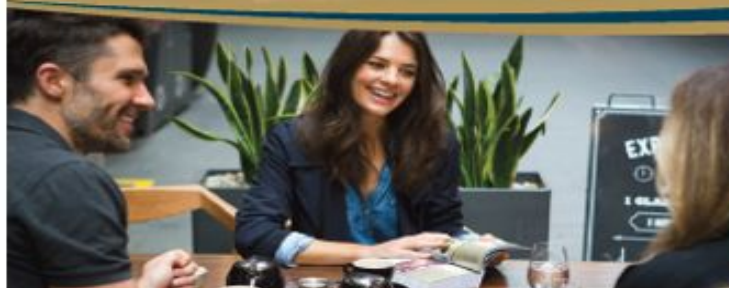
The entertainment Book

Still just $60 giving you over $20,000 of value!